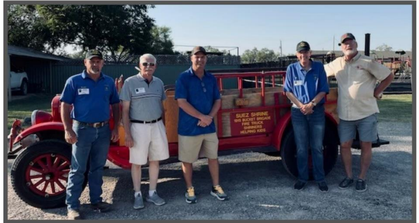
Paintrock Lodge 613, OH Ivie Volunteer Fire Department with Suez Shrine Fire Truck at Paint Rock ISD For Fire Prevention Week.