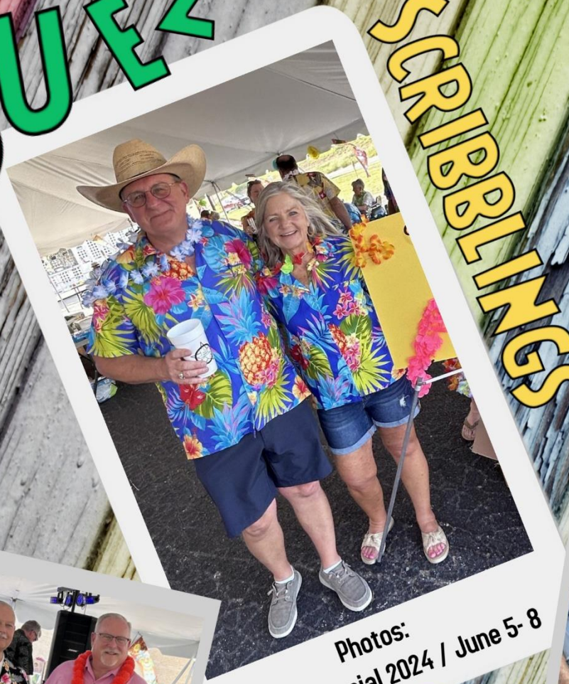
Photos: TSA Ceremonial 2024 / June 5- 8