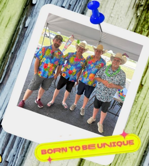
BORN TO BE UNIQUE