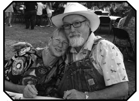
Jerry Jones and his Lady