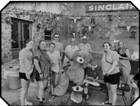
Friends having fun at Blue Agave Cattle Company in Blackwell TX