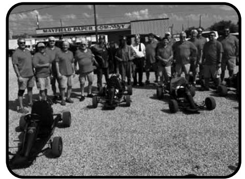
Brothers of Mystic Wheels, Moslah Temple, and Abilene Shrine Club. Brotherhood transcends any distance!