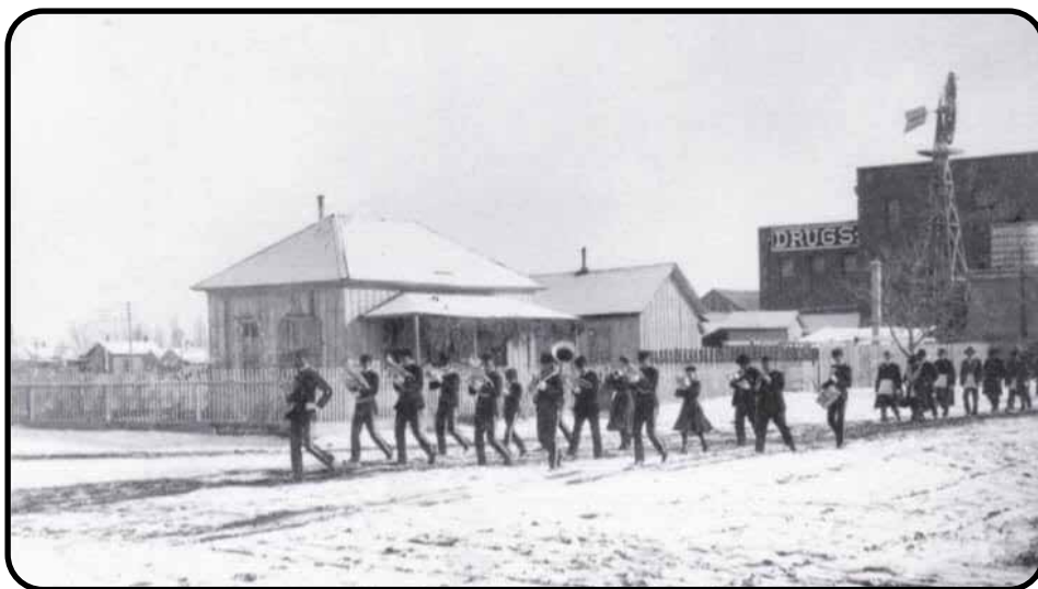
A photo of a Masonic Parade in Midland, Texas in 1904. The first Masonic Lodge was founded in 1886, just five years after Midway, later named Midland, was founded.

The Midland Shrine Club is back up and running. We miss your face. Come see us at our Monthly Social on the 3rd Thursday of the month at 6pm. Hard to believe that our club elections are two months away. If you haven't been in a while, come see the new sign we have out front.