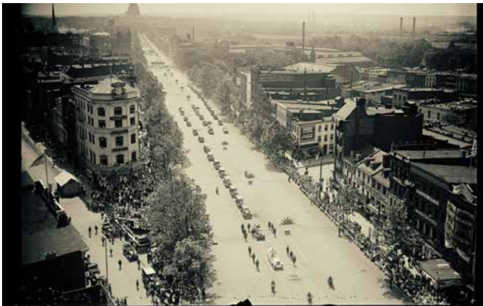
When the Shriners International held their national convention in Washington DC in June of 1923, the Washington DC Grand Lodge welcomed visitors with a Grand Masonic Parade down Pennssylvania Avenue. The tradition goes back to 1793 when President George Washington marched with Masons to lay the US Capitol Cornerstone.