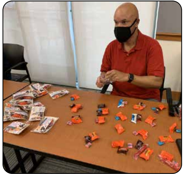
Our friends at Aloha Temple in Hawaii teamed up to get candy bags ready to hand out for Halloween at the Aloha Stadium Trunk or Treat event. Aloha Nobles and Employees at Shriners Children's Honolulu all pitched in to help