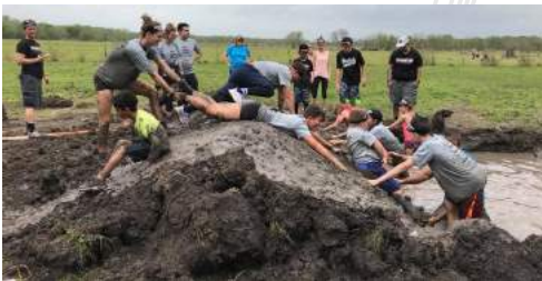
Our kiddos demonstrated their grit this past weekend. We brought them out to the Spartan Race where they ran, jumped, and climbed over a muddy one mile obstacle course