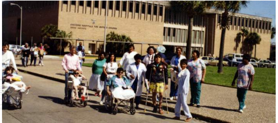
Did you know? 52 years on March 20, 1966, the first Shriners Hospital for Children - Galveston building was opened. Staff and patients are seen moving to the new building from their original home known as the Shriners Burn Institute at John Sealy Hospital.