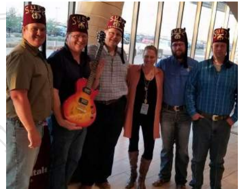
Suez was invited to Midland on Monday, April 23rd. A popular Rock Band, Foreigner, played at the Wagoner Noel Center and the promoter wanted Shriners to help sell CDs and Raffle tickets for a chance to win an autographed electric guitar from the band. We raised almost $2,000 for Shriners Hospitals for Children