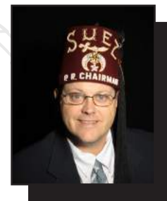
JB Cloud Public Relations

What a busy month we had. The Shriners Ball was a big hit. I attended a Rock Concert in Midland with other Suez Nobles to raise money. Pictures and the story later in the issue. It was great to see some new Nobles and their Ladies and I know that our presence in the community, doing good things and wearing our Fezes makes a difference. We need to be seen online, on Facebook and in person at