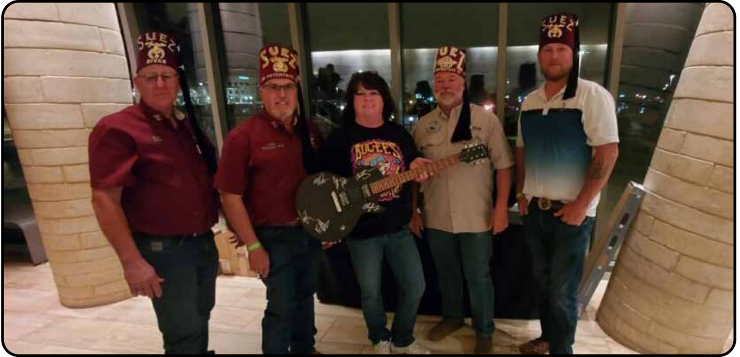
Suez Shriners came out to the Foreigner Concert in Midland. Foreigner has teamed up with Shriners across the world to help CDs and Giveaway a Guitar at each of their shows. A portion of the proceeds benefit Shriners Childrens