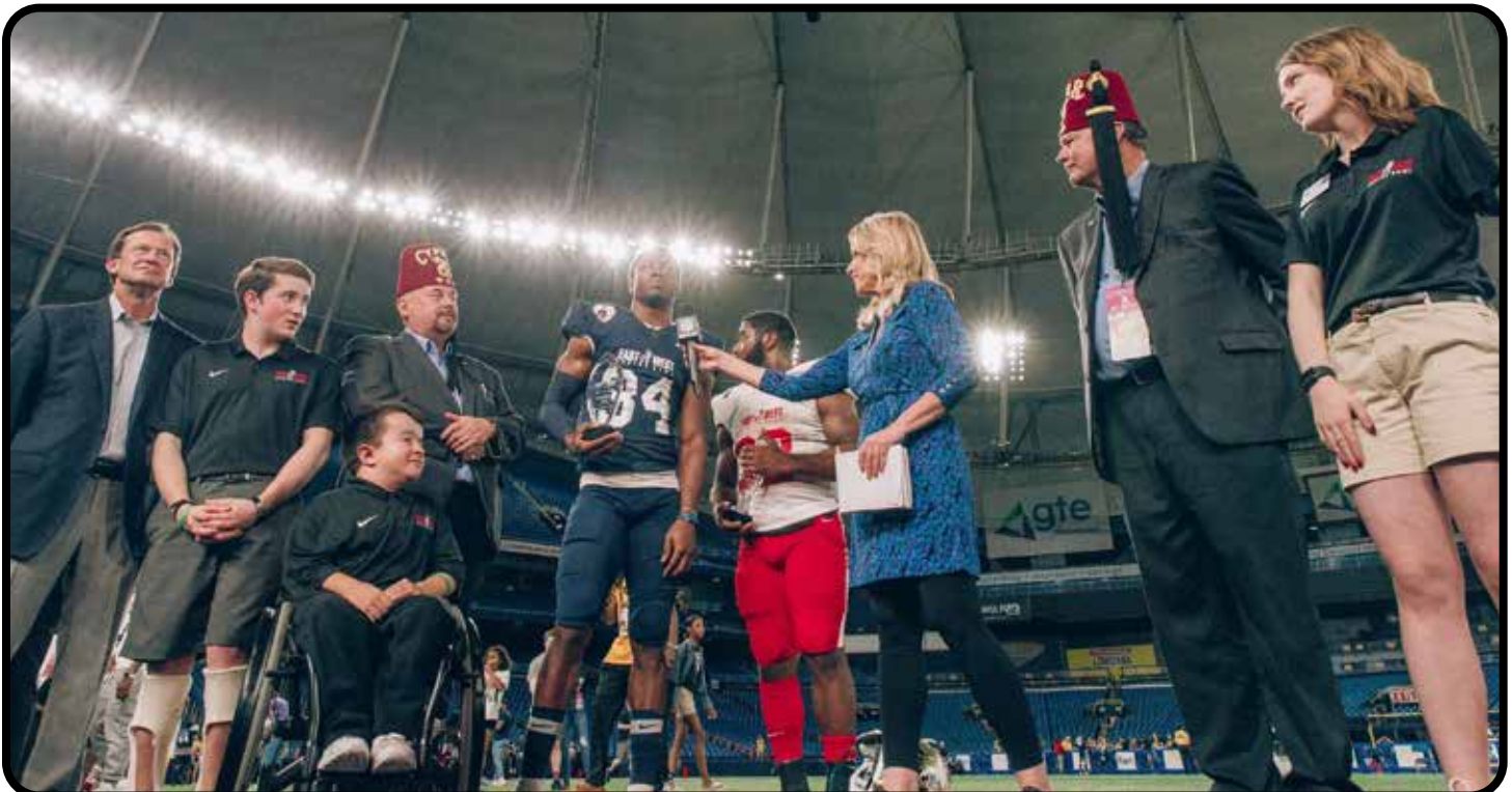
Congratulations to the East West Shrine Bowl MVPs! And thank you to the players, coaches, staff, volunteers and our patient ambassadors for making this a great week!