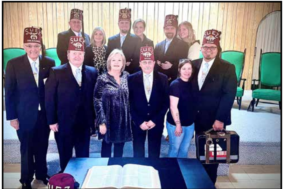
Suez 2023 Divan