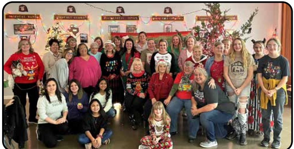
Ladies of Suez Shrine