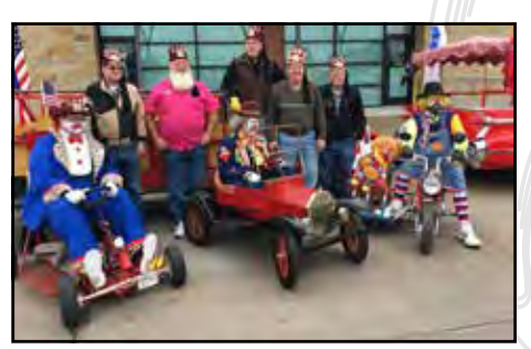
San Angelo Rodeo Parade Crew