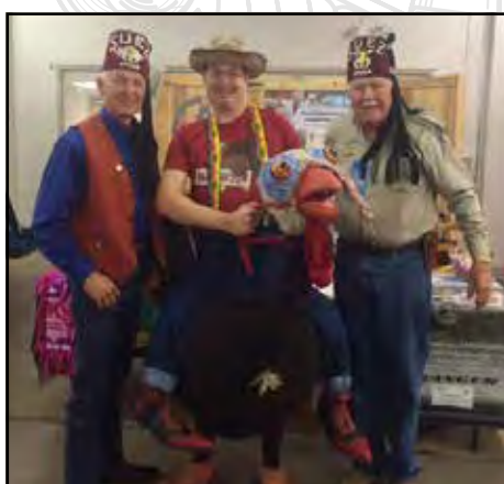
Suez Divan Working Rodeo Booth