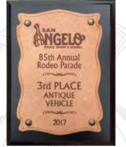
Greeters Fire Truck Won an Award

Some of our Greeters rolled out the Suez Fire Truck for the San Angelo Rodeo Parade and we ended up winning 3rd Place for Antique Vehicle. We didn't even know that there was a competition. This is just one of the many things that we can do. We hold the door and greet those that attend our Stated meetings and Club Socials. Come down to a Stated Meeting and ask about joining the Greeters.