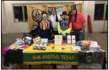
San Angelo Rodeo Booth with Klowns