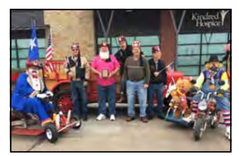
San Angelo Rodeo Crew