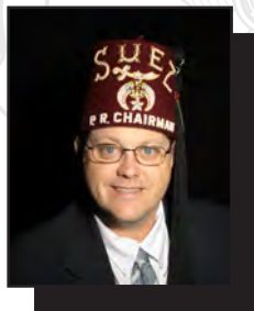
JB Cloud Public Relations

I have been super busy keeping up with the website and facebook page. My apologies for missing the past few Stated Meeting. JB has 3 kids and we've had Baseball and Softball on Mondays. Keep taking and sending pictures from your