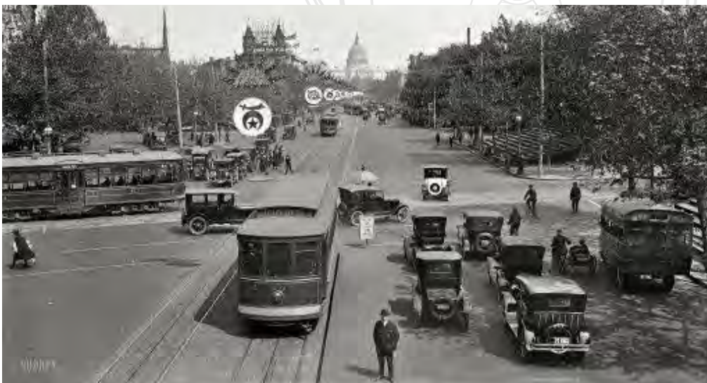
Reviewing Stands Reviewing stands set up for the Shriners Convention of June 1923, which hosted a quarter-million delegates from lodges and temples across the US in Washington, DC.