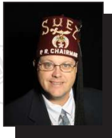
JB Cloud Public Relations

Wow, that was the shortest Long Summer ever. So much has happened since our last issue and I encourage each of you to head over to our Website www.suezshriners.com and facebook page to keep up. Next Summer we may even do online only issues for the Summer. We had that much going on. First off, Wooohoo and Yippeeee!!! Suez won a 2017 Dromedary Award for our Website. This is Huge Honor. Thank you to everyone who helped me get information and pictures for