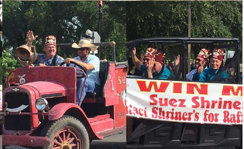
TSA Parade – Part of the fun at TSA is the Large Parade and competition. Suez was well represented.